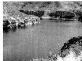
Yellowtail Dam Recreational Site

This is an opportunity for a life changing experience that promotes understanding by allowing participants to walk in the moccasins of contemporary "First Nations" people.